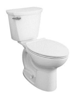
Cadet Pro Tall, Elongated Bowl: