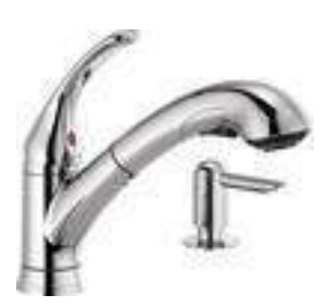
Delta Foundations: $485 Installed