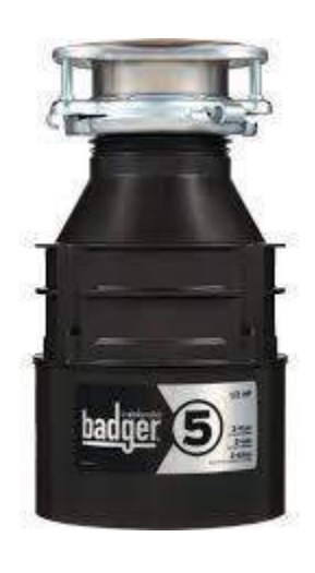
Badger 5 1/2 HP: