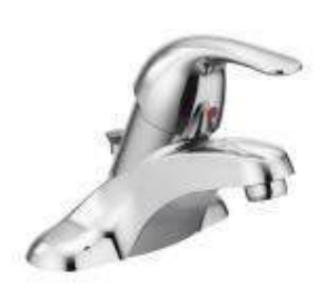
Adler Chrome Single Handle: $430 Installed