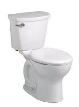
Cadet Pro Tall, Round Bowl: