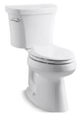
Wellworth Standard, Round Bowl: