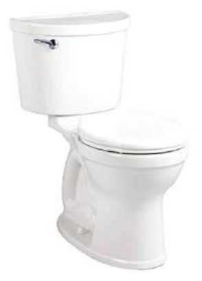
Champion Pro Tall, Round Bowl: