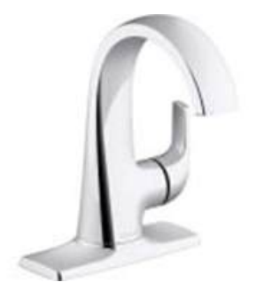
Cursiva Chrome: $545 Installed